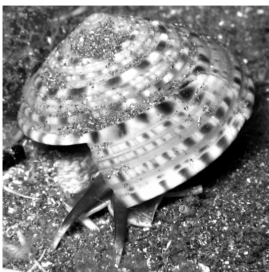
Fig. 1. Living animal of Architectonica nobilis (photo Peter Wirtz).

Smaragdia viridis is known from the Mediterranean Sea and in the Eastern Atlantic from the Canary Islands south to Angola (POPPE & GOTO 1991; ROLÁN 2005).