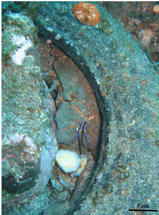
Fig. 2. Scyllarides latus inside its shelter (a used car tire, with one boulder inside) during feeding with limpets.

served as potential shelters inside the cage (Fig. 2). Lobsters were monitored and fed with fish and limpets about once a week, depending on weather conditions, over a period of nine months.