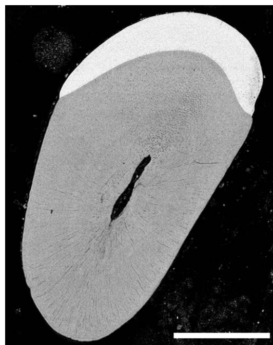
Fig. 1. Polished fracture of mouse lower incisor. Scale bar = 500 \mu m

Data were registered as weight percentage (wt %) and arcsin transformed prior to analysis by means of a factorial ANOVA and Tukey post-hoc tests. Cochran's test for homogeneity of variances amongst groups was used prior to analyses to ensure operation at \alpha=0.05 . The colour pattern was assessed using four rank criteria: 0, no coloration; 1, weak coloration; 2, strong coloration; 3, very strong coloration. Results were analysed by means of a t-test for independent samples (n=20) (ZAR 1999).