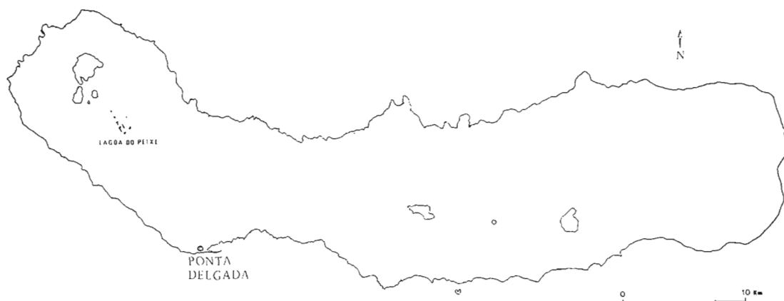
Fig. 1 - Site location of the lake (S. Miguel island).

identified by the hooks on the ischia of the third and fourth pereopods (SUKÔ 1953, HOBBS, JR. 1974; 1989). Sexually mature females were distinguished by the presence of tan, brown and black eggs in the ovary (ROMAIRE & LUTZ 1989) and by the grooved annulus ventralis (HUNER & BARR 1991). Post-ovigerous females were also considered mature.